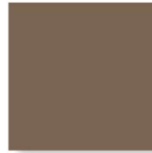
Light Brown TSR = 36%