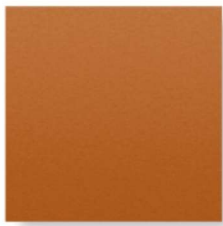
Copper Metallic ‡ TSR = 46%