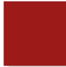
Bam Red TSR = 32%