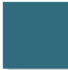
Royal Blue TSR = 31%