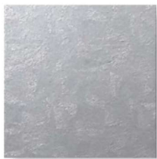
Acrylic Coated Galvalume TSR = 59%