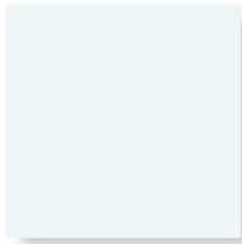
Arctic White* TSR† = 63%