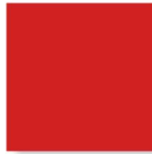
Patriot Red TSR = 36%