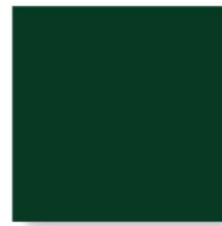
Evergreen TSR = 26%