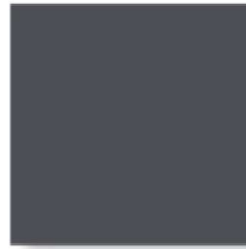
Burnished Slate TSR = 32%