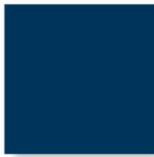
Gallery Blue TSR = 25%