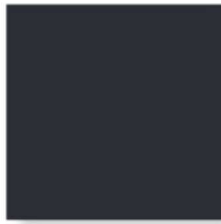
Black TSR = 25%